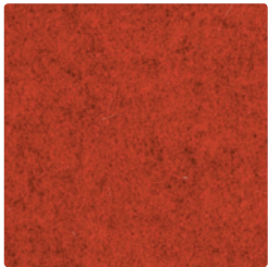
Blazer Edge Hill